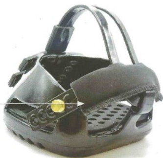
Bulb Strap Gaiter

Speak with your hoof care professional who may be able to create or recommend a custom pad using different materials or design to better suit your horse's particular pathology.