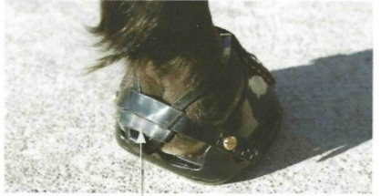
Bulb Strap Extender